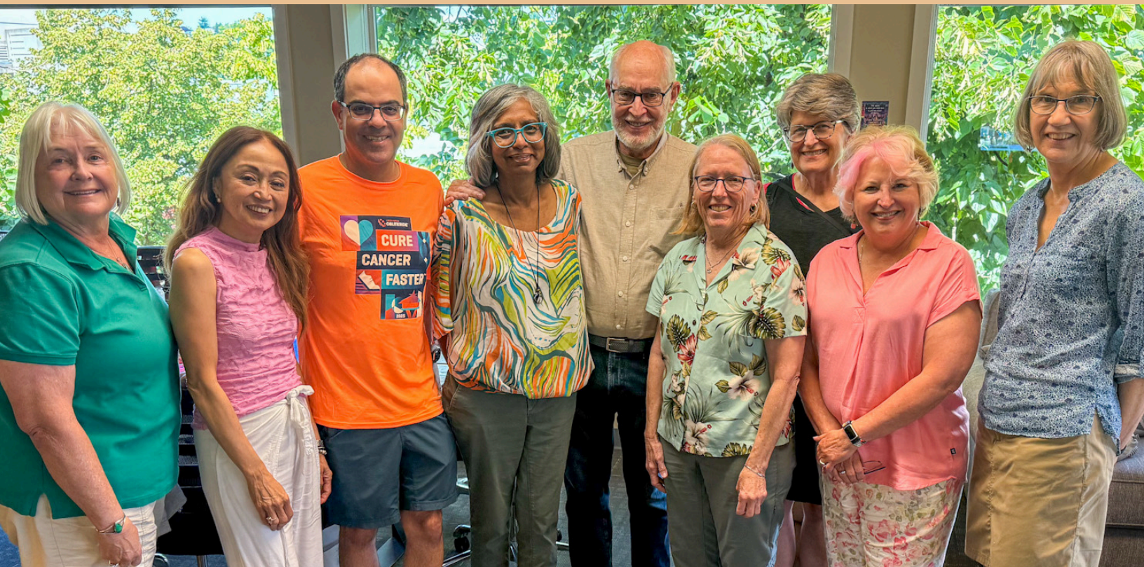
Photo: Some of our Companis board members. See a full list of our board on Page 8.